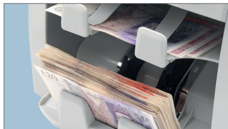
DOUBLE POCKET CONFIGURATION