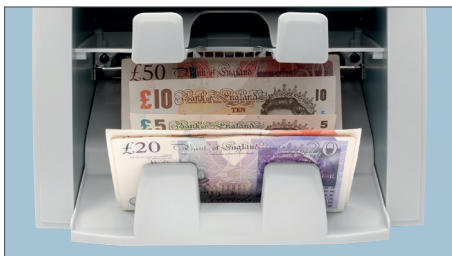
VALUE COUNTING FOR MIXED EUR, GBP, USD, CHF BANKNOTES