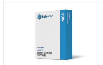
Safescan MCS Software Art. no: 124-0500