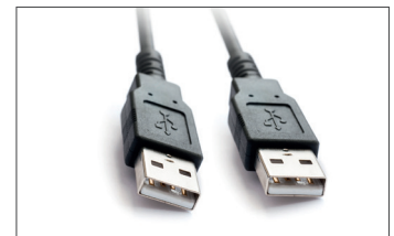
Safescan USB Cable Art. no: 124-0458