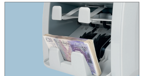
BATCH FUNCTION, TO CREATE FIXED SERIES OF A PRE-SET NUMBER OF BANKNOTES