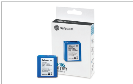
Safescan LB-105 Rechargeable battery Art. no: 112-0410