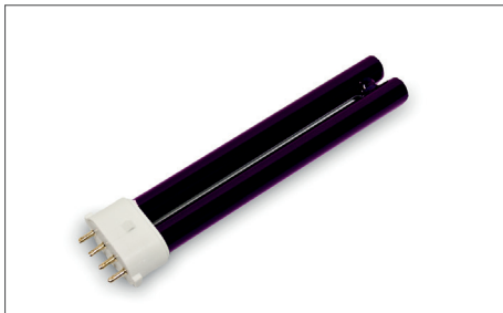
Safescan 50 / 70 UV tube Art. no: 131-0411