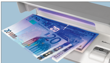
VERIFIES UV FEATURES OF BANKNOTES - SUITABLE FOR ALL CURRENCIES