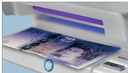
POWERFUL UV LAMP FOR OPTIMAL COUNTERFEIT VERIFICATION RESULT