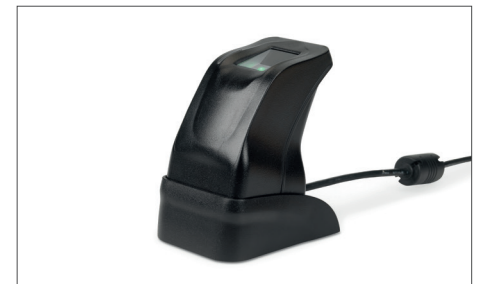
TimeMoto FP-150 USB Fingerprint Reader Art.no: 125-0606