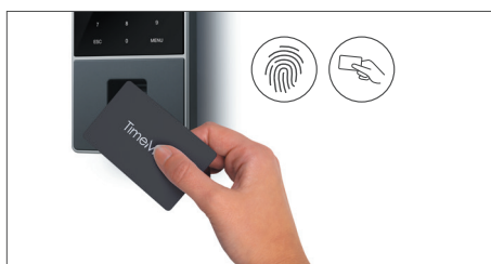
Clocking with RFID proximity card, Fingerprint or PIN code

* After the 30-day trial, choose your subscription: TimeMoto Cloud or TimeMoto Cloud Plus