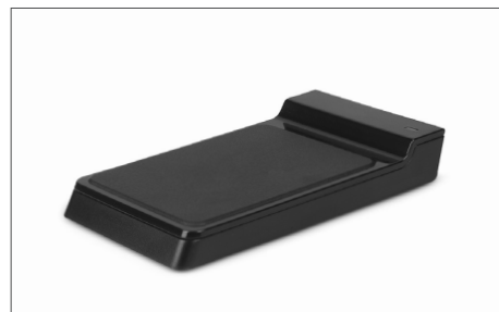
TimeMoto RF-150 USB RFID Reader Art. no: 125-0605