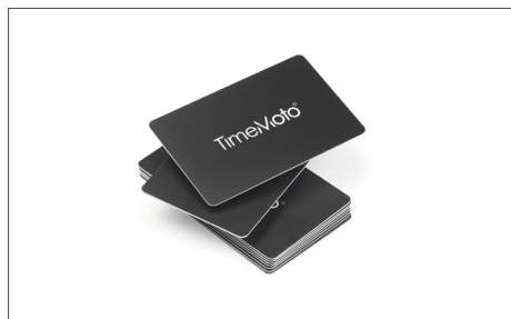
TimeMoto RF-100 set of 25 RFID badges Art. no: 125-0603