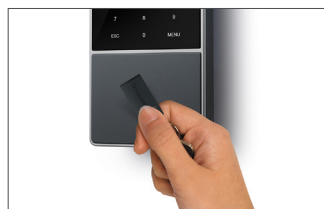
Clocking in/out with MIFARE, DESfire, RFID badge or PIN