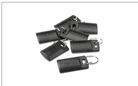
TimeMoto RF-110 set of 25 RFID key fobs Art.no: 125-0604