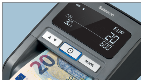
SHOWS VALUE AND TOTAL AMOUNT OF THE SCANNED BANKNOTES