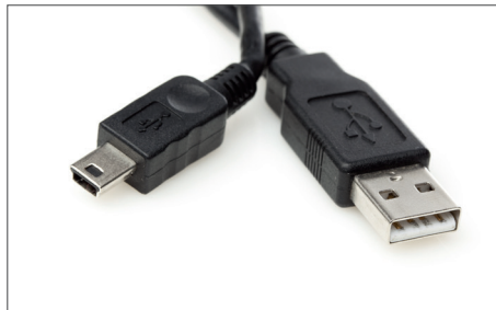
Safescan USB update cable Art. no: 112-0459