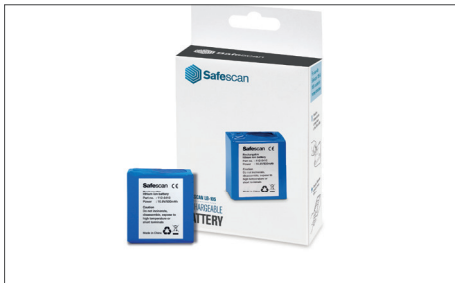
Safescan LB-105 Rechargeable battery Art. no: 112-0410