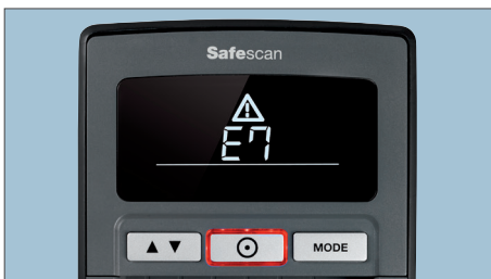
ALARM WHEN A SUSPICIOUS BANKNOTE IS DETECTED