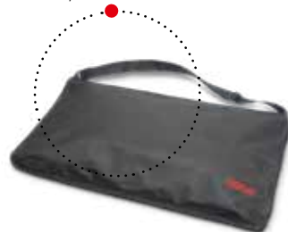
Carrier bag 412 for convenient transport.