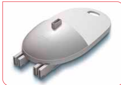
Integrated handle and secure catches on all individual parts for transport ease.

The stadiometer seca 213 can be used anywhere because the large floor plate provides the necessary stability. The stadiometer seca 213 is therefore the ideal piece of equipment for all those who require reliable measuring instruments at frequently changing locations.