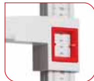
Two large windows and double-sided scale for easy readout.